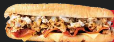
Creamy Cicken 3.25

Grilled Creamy Chicken mixed with Fresh sautéed Mushroom, zucchini and Carrots.