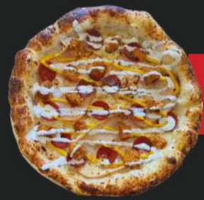
Zinger Pizza - Spicy

Tomato sauce, Mozzarella, Oregano and Strips of Grilled chicken breast topped with spicy buffalo sauce