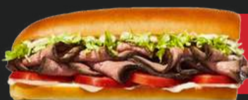
The Club 2.95

Tomato, cucumber and White cheese topped with Lettuce, Oil And Vinegar with prime fresh Tuna Salad.