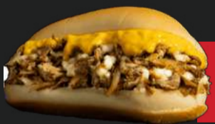
Philly CheeseSteak 3.25

Mayo With Tomato and White cheese topped with Lettuce, Oil And Vinegar with prime fresh Italian Salami and Bologna. your choice of Premium Deli meat in grams