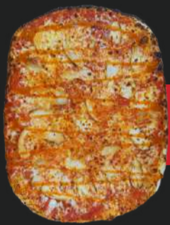
Buffalo Chicken - Spicy

Alfredo sauce, Mozzarella, Oregano, Grilled Chicken, Mushroom and Parmesan Cheese