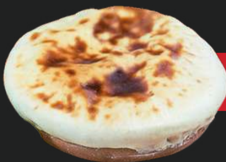
Fillet Steak Pottery

Gourmet Creamy sauce and Mozzarella with mushroom carrots, Zucchini, Brockley And Sautéed Fresh chicken (good for 2 ppl)