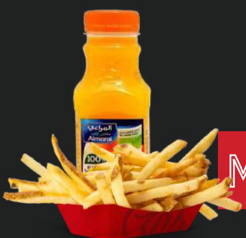
Make it a Meal ?! + 1.50

Tomato and Lettuce, Chicken and Beef Bacon topped with our home made Ranch.