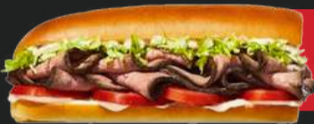
Roast Beef 2.95

Mayo With Tomato and White cheese topped with Lettuce, Oil And Vinegar with prime fresh Bologna Mortadella. your choice of Premium Deli meat in grams