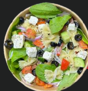
Spinach Greek Pasta Salad

Fresh fusilli Pasta, Cherry tomato, Black olives, Cucumber, Lettuce and Feta Cheese