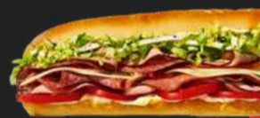
The Italian 2.95

Mayo With Tomato and White cheese topped with Lettuce, Oil And Vinegar with prime fresh Roast Beef and Turkey. your choice of Premium Deli meat in grams