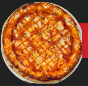
Buffalo Chicken - Spicy

Alfredo sauce, Mozzarella, Oregano, Grilled Chicken, Mushroom and Parmesan Cheese