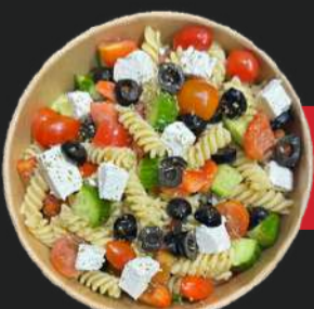
Greek Pasta Salad

Fresh Lettuce, Corn, Cherry tomato, Carrots, Red Cabbage topped with Crispy tenders