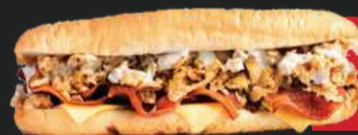
Chicken Bacon Ranch 3.25

Prime Steak, Mushrooms, Onions, Bell peppers, topped with Cheddar cheese