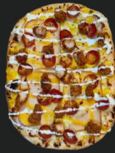
Zinger Pizza - Spicy

Tomato sauce, Mozzarella, Oregano and Strips of Grilled chicken breast topped with spicy buffalo sauce