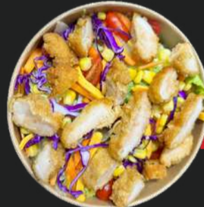
Tenders Cobb Salad

Fresh Iceberg lettuce, Carrots, Slices of Cucumbers, Corn, Avocado topped with Crab